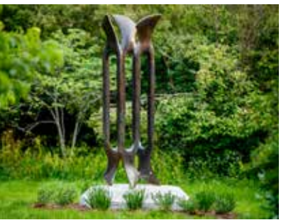
Neil Goodman Sound of the Woods